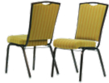
PHBC401 aeroflex Seat Width: 18"