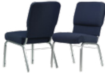
PHBC200 Seat Width: 20"