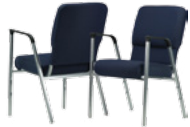
PHBC200A Seat Width: 20"