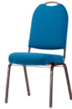
PHBC101 Seat Width: 18"