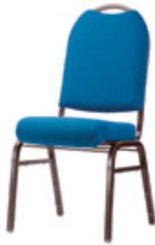
PHBC100 Seat Width: 16"