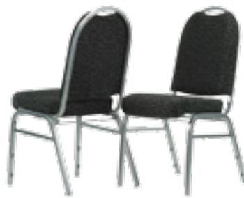
PHBC100 aeroflex Seat Width: 16"