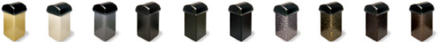
Camel -10 Beige -11 Grey -12 Hammer Black -13 Enviro Green -14 Enviro Black -15 Silver Vein -16 Gold Vein -17 Bronze Vein -18 Copper Vein -19