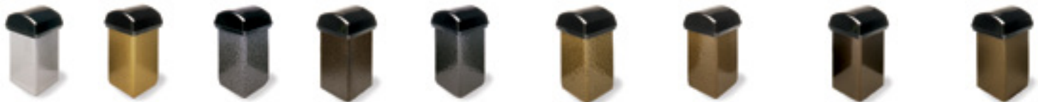
Silver -20 Gold Sun -21 Grey Stone -22 Java -23 Charcoal Stone -24 Gold Hammer -25 Bronze Hammer -26 Architectural Bronze -27 Antique Bronze -28