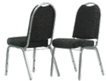
PHBC101 aeroflex Seat Width: 18"